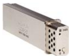
Figure 11. 240-GB SSD storage