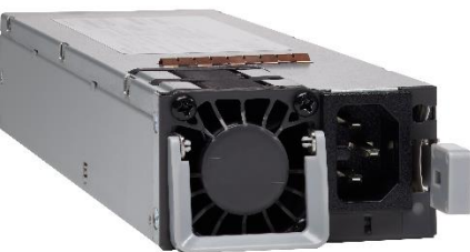
Figure 14. 1600W AC power supply