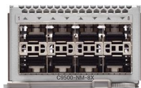
Figure 9. Cisco Catalyst 9500 Series network module 8-port 1/10 Gigabit Ethernet with SFP/SFP+

Figures 9 and 10 show the available network modules