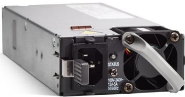
Figure 12. 950W AC power supply

Figures 12 through 14 show the power supplies available for the Cisco Catalyst 9500 Series