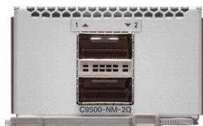
Figure 10. Cisco Catalyst 9500 Series network module 2-port 40 Gigabit Ethernet with QSFP+