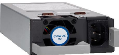
Figure 13. 650W AC power supply